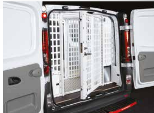
Two-person prison cell with side facing seats.