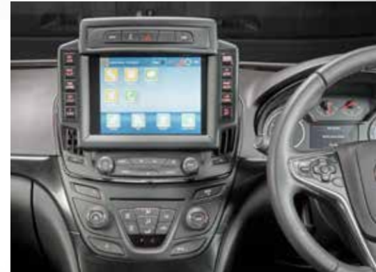
Image shown features switch panel facia with touch screen.