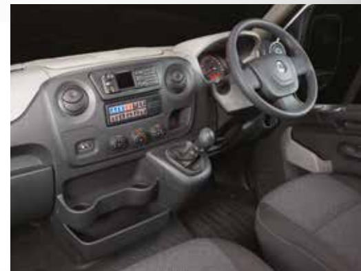
Image shown includes independent communications fascia head unit and 10-way switch panel.