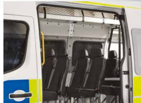
Configurable seating solution.