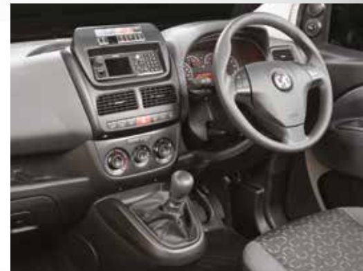
Image shown includes combined 10-way switch panel and aperture for communications head unit.