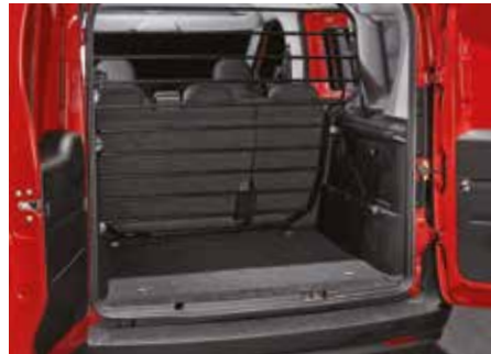
Load area with steel load guard.