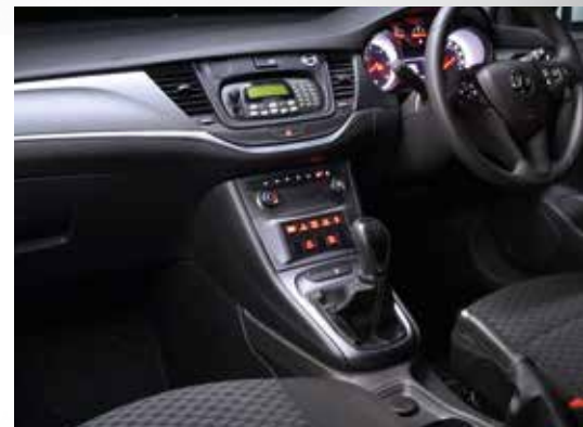
Image shown includes independent communications fascia head unit and 10-way switch panel.