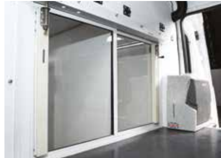
Rear escape hatches.