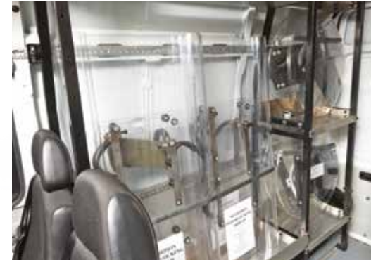
Configurable storage solution.