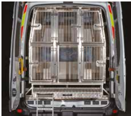
Six compartment dog cell.