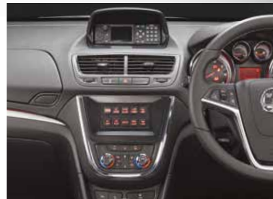
Image shown includes independent communications facia head unit and 10-way switch panel.

*Emergency model based on Exclusiv trim.