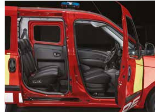
Twin glazed sliding side doors.