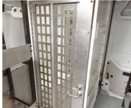
Single containment cell.