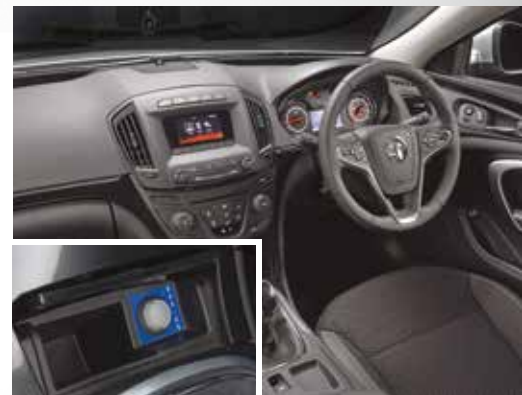
999/At scene dual function, covert single switch.