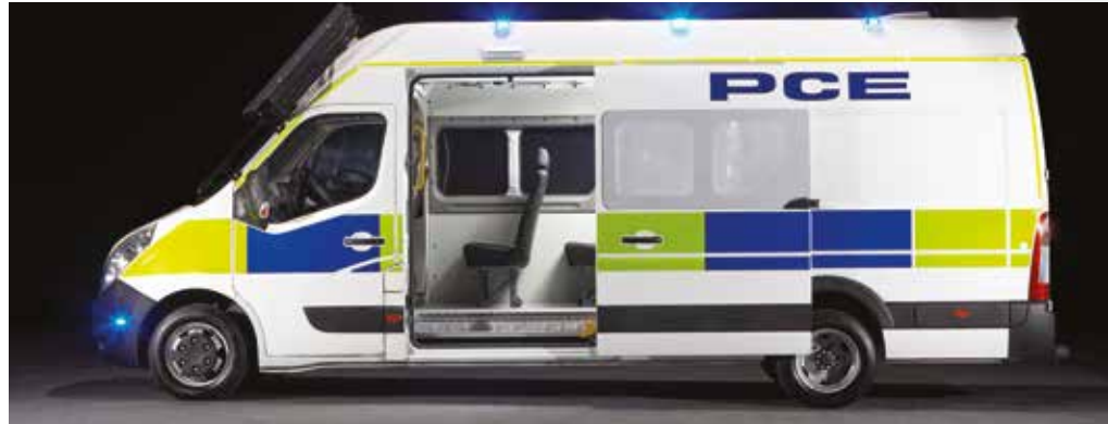
Image shown features 360° high level lighting and nearside despatch light.