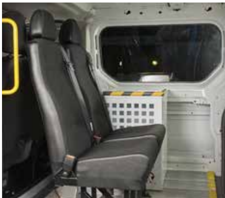
Image shown features storage box and configurable seating solution.