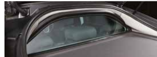
Rear upstand between passenger and rear load compartments. (Hatchback model shown)