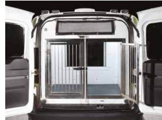
Lockable stainless steel gates with overhead storage.