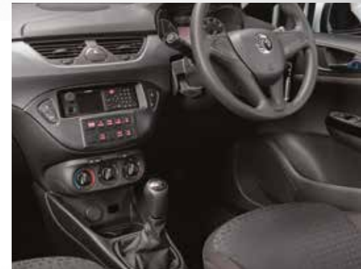
Image shown includes combined 10-way switch panel and aperture for communications head unit.