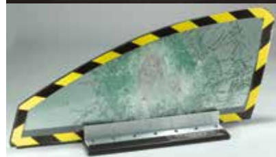
Glass ballistically tested.