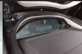
Rear upstand between passenger and rear load compartments. (Hatchback model shown)