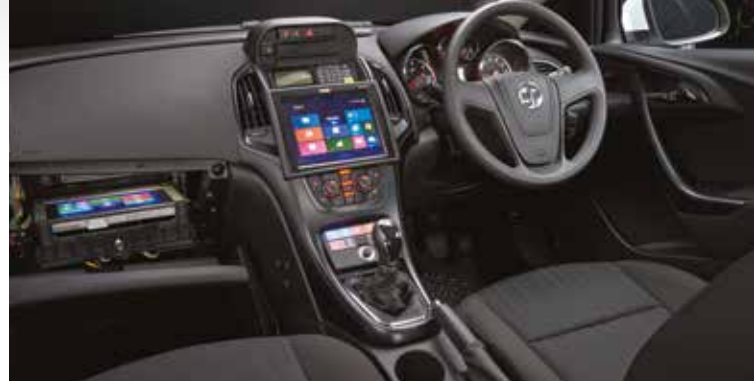
Image shown includes optional Rugged tablet, Central Repeater Screen and additional USB Keyboard.