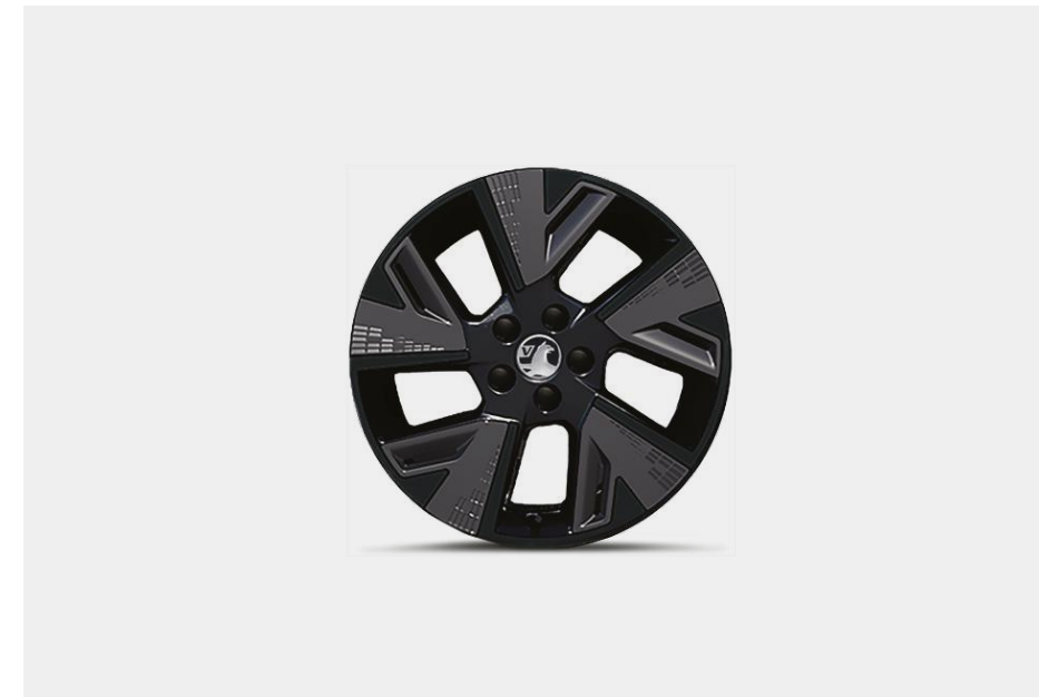
18-inch alloy wheel.