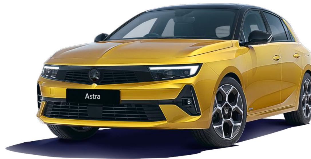
Electric Yellow (MORV)† Two-coat premium metallic paint £700