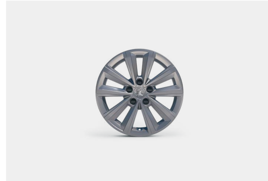
16-inch alloy wheel.