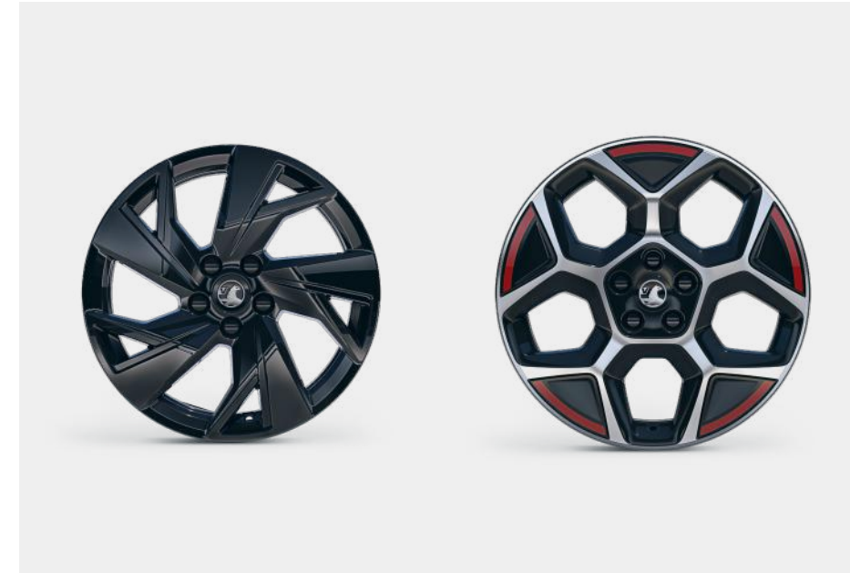
17-inch alloy wheel. 18-inch alloy wheel (extra cost option).**