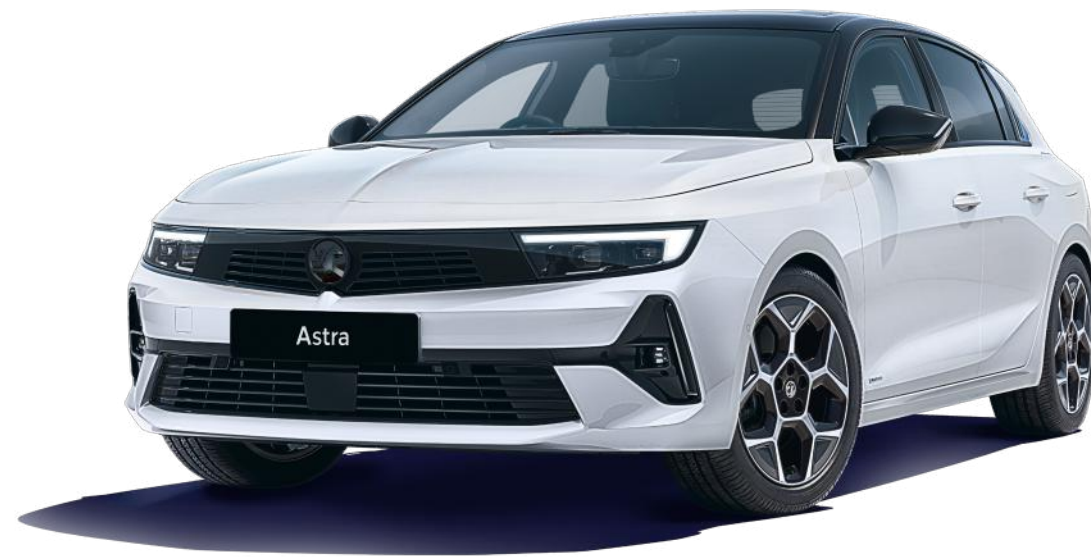
Arctic White (POWP)* Brilliant paint