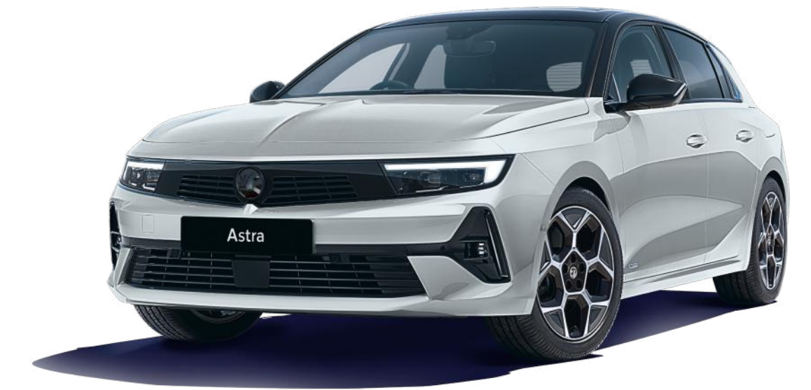
Crystal Silver (MOZR)** Two-coat metallic paint £600