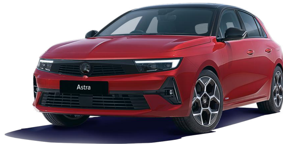
Crimson Red (M5PQ)** Two-coat premium metallic paint £700