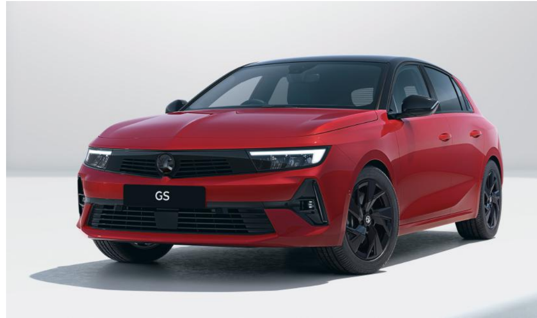
GS Petrol/Plug-in Hybrid.