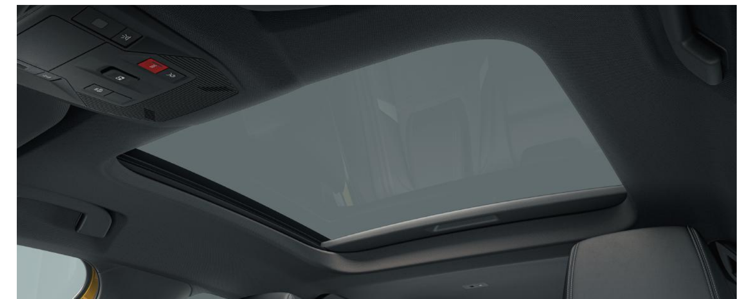
Electrically operated slide/tilt glass sunroof with blind.