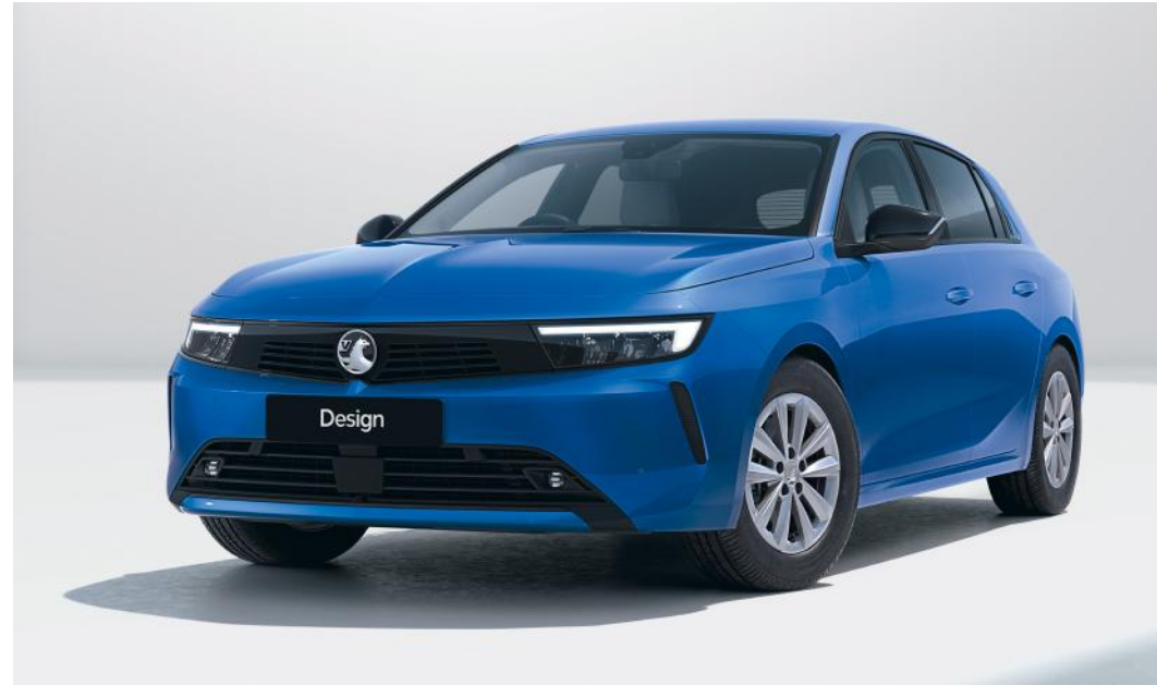
Design Petrol/Plug-in Hybrid.