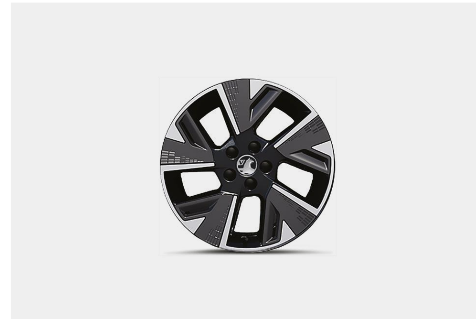
18-inch alloy wheel.