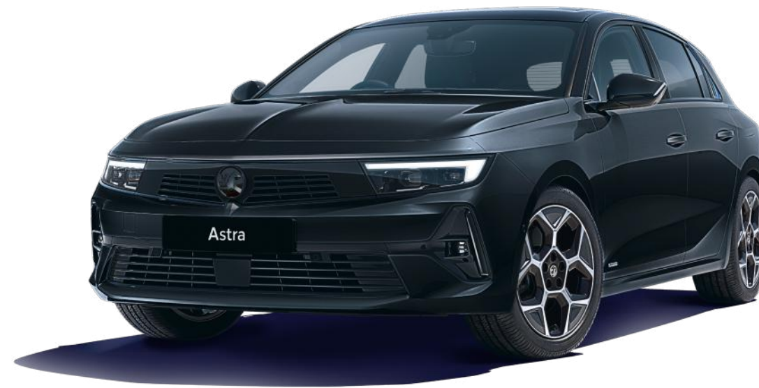
Carbon Black (M49V)** Two-coat metallic paint £600