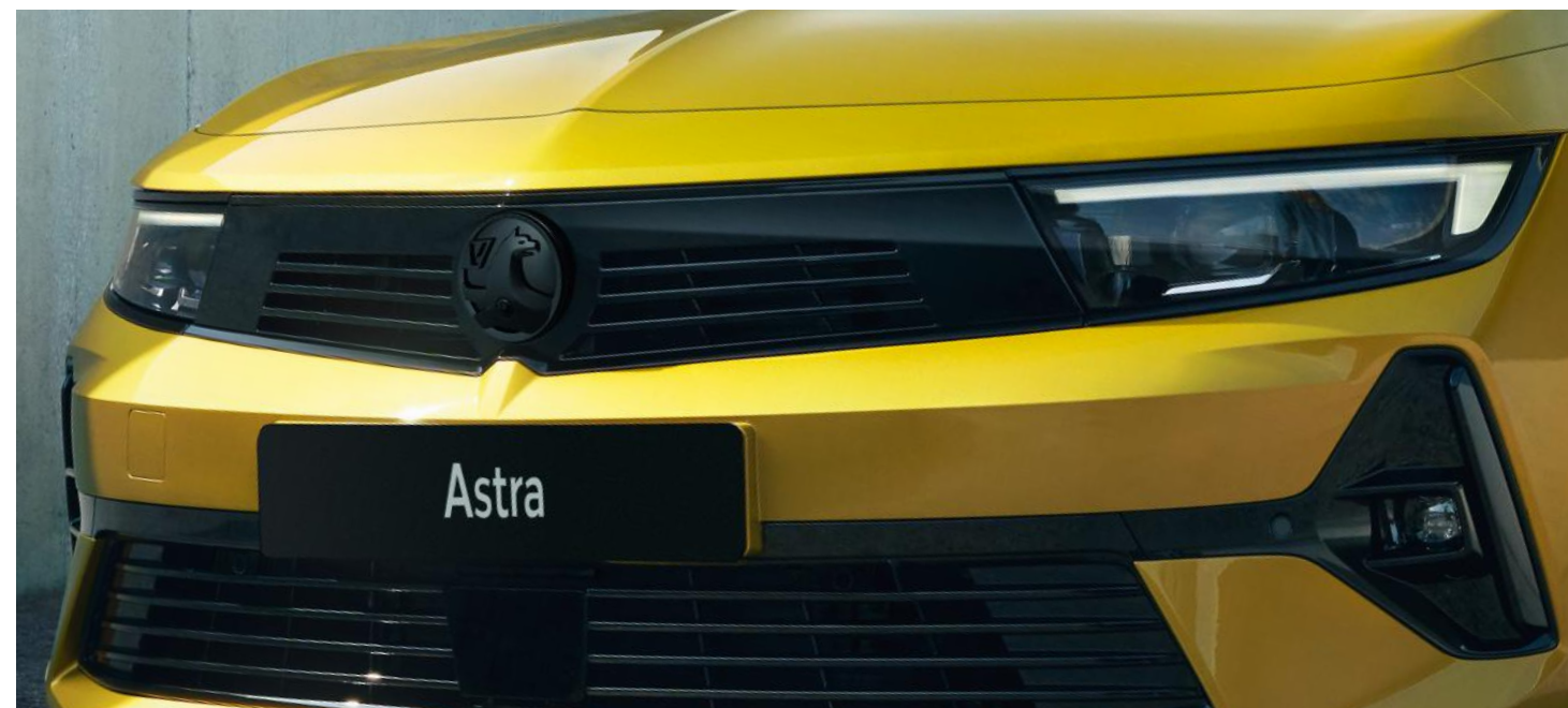
Black Griffin logo and vizer frame.

*Optional at extra cost including VAT. **Standard with Carbon Black body colour. †Not available with Electric Yellow or Cobalt Blue paints.