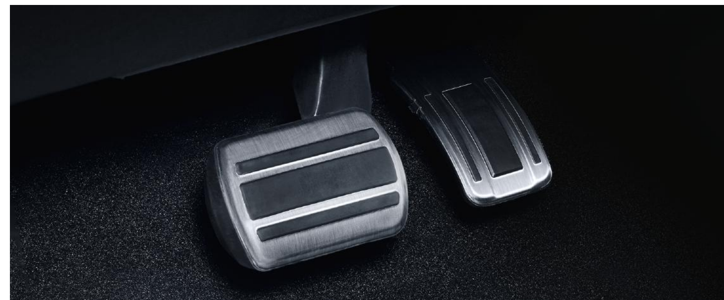
Alloy-effect sports pedals.