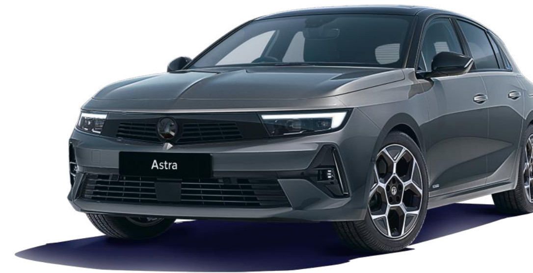
Vulcan Grey (MOVL)** Two-coat metallic paint £600