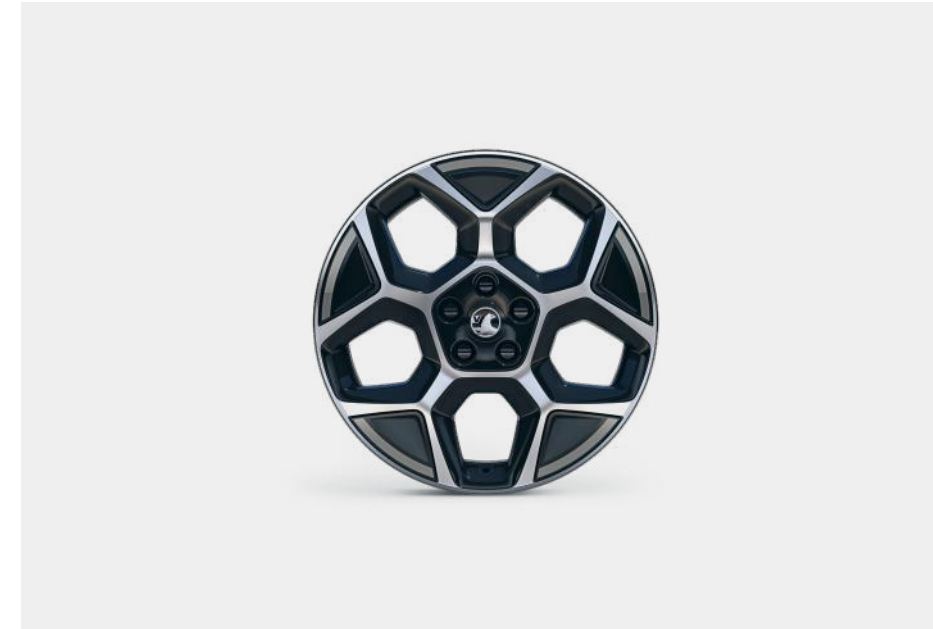
18-inch alloy wheel.