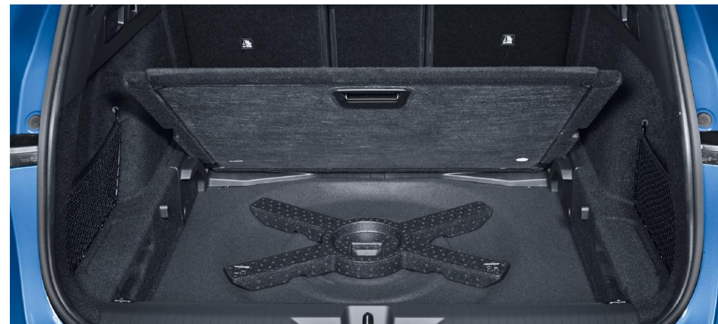
Intelli-Space adjustable load floor.