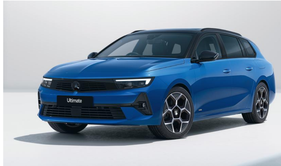
Ultimate Petrol/Plug-in Hybrid.