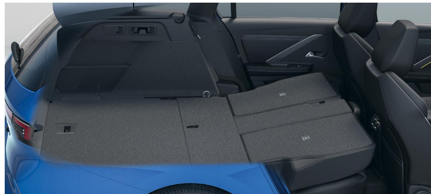
Intelli-Space 40/20/40 split rear seats.