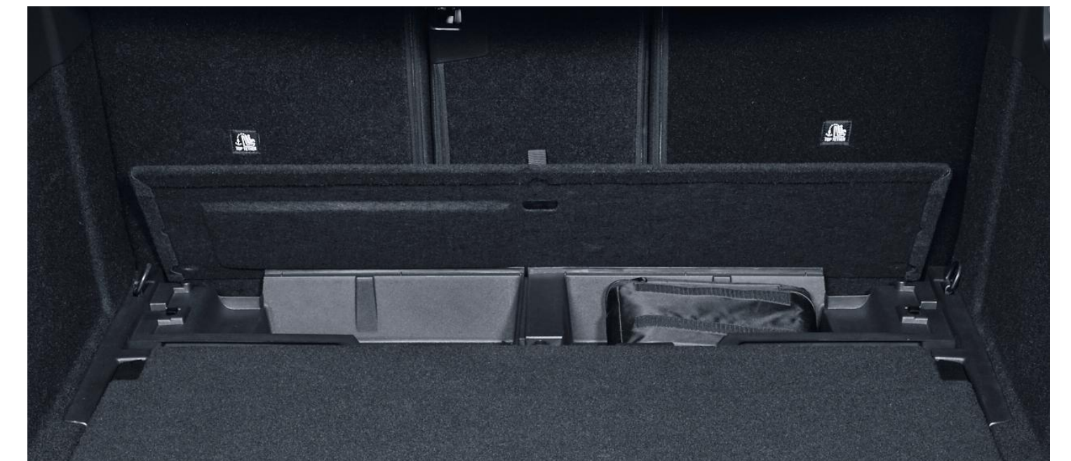
Easy accessible storage boxes.