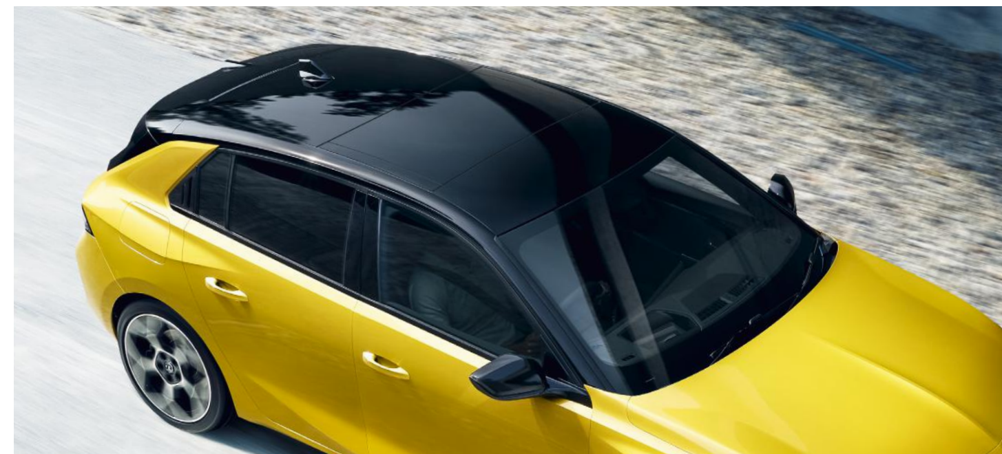
Black roof and dark-tinted rear windows.