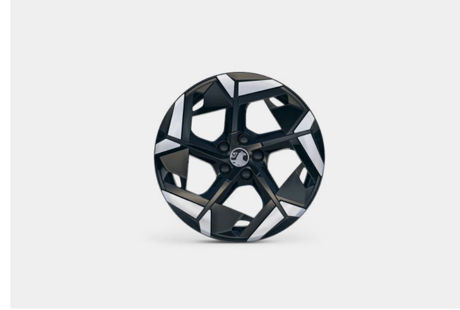
18-inch alloy wheel.