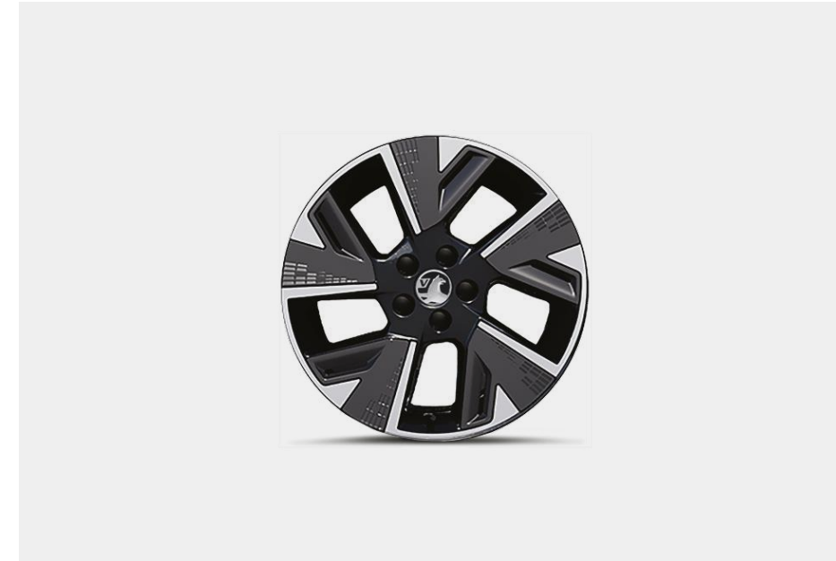
18-inch alloy wheel.