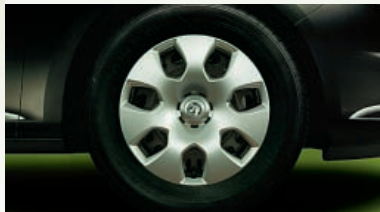
16-inch steel wheel with flush cover.