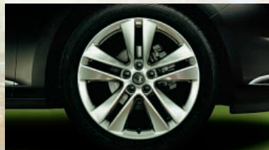
18-inch alloy wheel (extra cost option).*