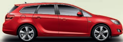
Power Red – Solid (two-coat)