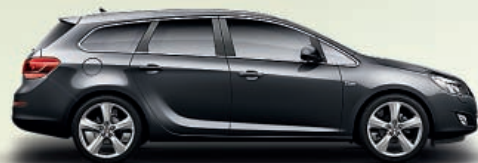
Technical Grey – Metallic*