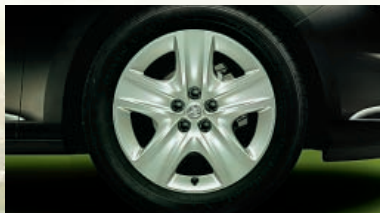
17-inch Structure wheel (no cost option).