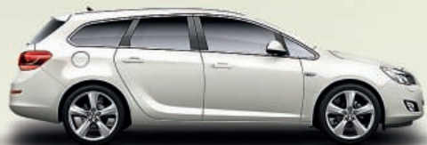
Olympic White – Solid