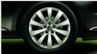
17-inch alloy wheel (extra cost option).