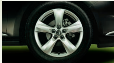
17-inch alloy wheel.