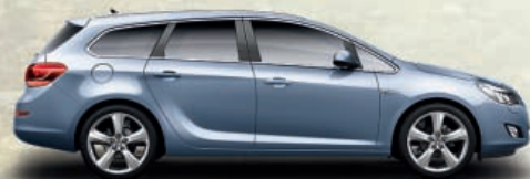
Fresco – Metallic*