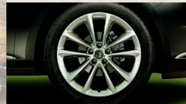
18-inch alloy wheel (extra cost option).** †