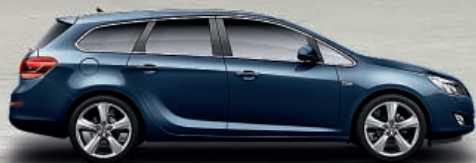
Waterworld – Pearlescent*