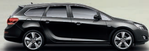
Black Sapphire – Pearlescent*