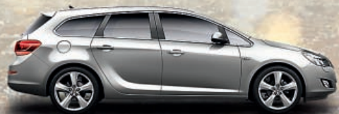
Sovereign Silver – Metallic*