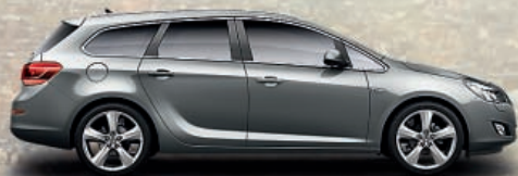
Silver Lake – Metallic*