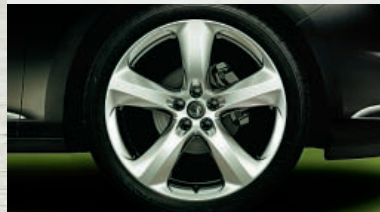
19-inch alloy wheel (extra cost option).*

Please note: All models feature a steel space-saver spare wheel. An emergency tyre inflation kit in lieu of the space-saver spare wheel is available at no extra cost. A full-size 16-inch spare wheel is also available at extra cost (not available on models with 18-inch or 19-inch wheels).