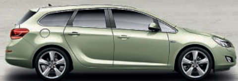
Silky Shadow – Metallic*