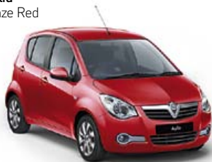
Solid Blaze Red

Availability of certain colours and trims may be limited. Please check with your retailer for more information.