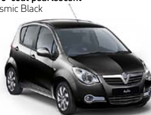
Two-coat pearlescent* Cosmic Black