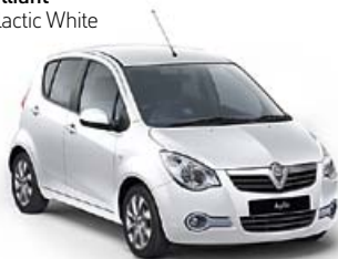
Brilliant* Galactic White