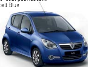
Two-coat pearlescent* Cobalt Blue