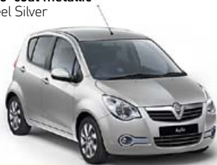
Two-coat metallic* Steel Silver