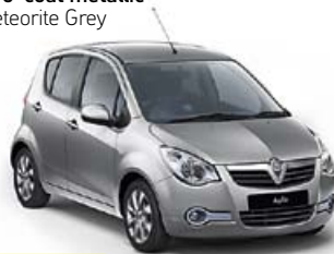
Two-coat metallic* Meteorite Grey