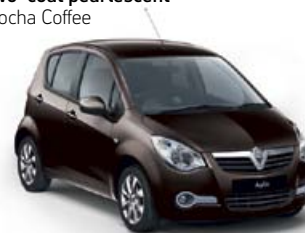
Two-coat pearlescent* Mocha Coffee