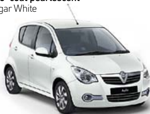
Two-coat pearlescent* Sugar White