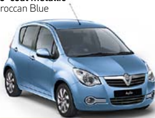
Two-coat metallic* Moroccan Blue