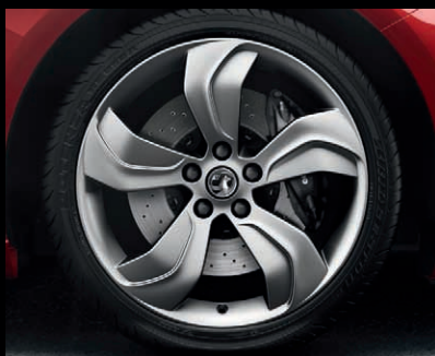
Standard 19-inch five-spoke alloy wheels with 245/40 R 19 ultra-low profile tyres.

Further changes to the chassis include brakes developed by competition supplier, Brembo, and the standard fitment of Vauxhall's fully adaptive FlexRide system with Continuous Damping Control (CDC) technology. In the new Astra VXR, FlexRide not only features a Sport button, but a VXR button, offering drivers the choice of two, more acute stages of damper, throttle and steering control.