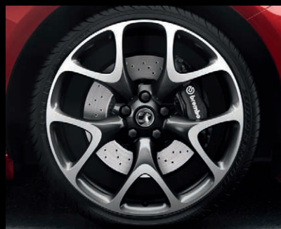
Optional 20-inch five-Y-spoke forged bi-colour alloy wheels with 245/35 R 20 ultra-low profile tyres.