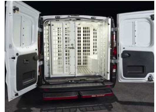
Vivaro police cell van.