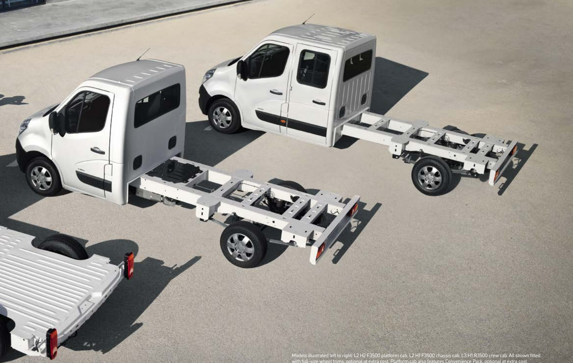
Models illustrated left to right: L2 H2 F3500 platform cab, L2 H1 F3500 chassis cab, L3 H1 R3500 crew cab. All shown fitted with full-size wheel trims, optional at extra cost. Platform cab also features Convenience Pack, optional at extra cost.