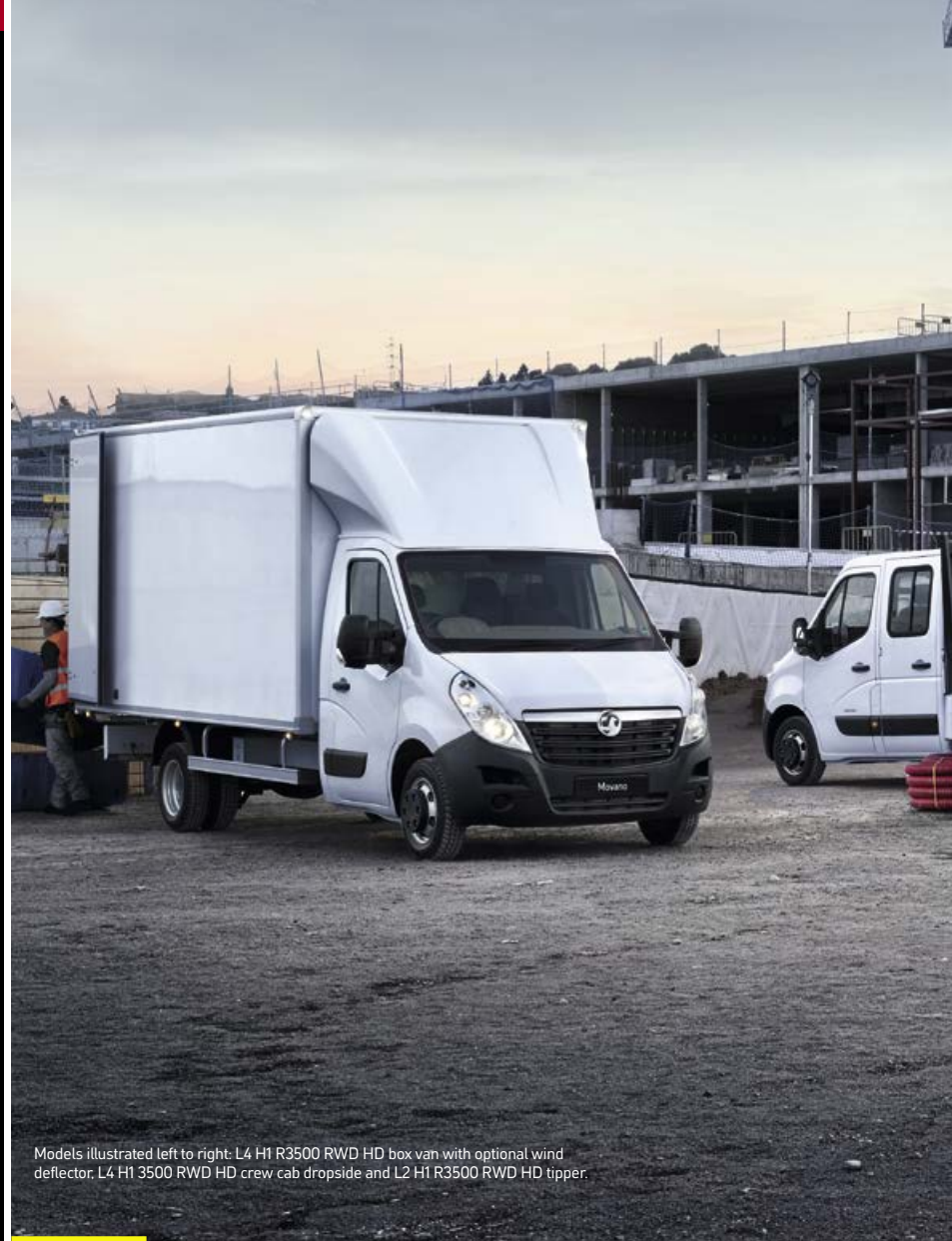
Models illustrated left to right: L4 H1 R3500 RWD HD box van with optional wind deflector, L4 H1 3500 RWD HD crew cab dropside and L2 H1 R3500 RWD HD tipper.

Besides the factory-based conversions there's a range of Vauxhall approved specialist conversions available across our commercial vehicle range too. From Combo through to the Vivaro and Movano ranges, there's an enormous breadth of choice to suit your exact requirements. And whichever model you choose, you can be confident your Vauxhall commercial vehicle will always be 100% fit for purpose.