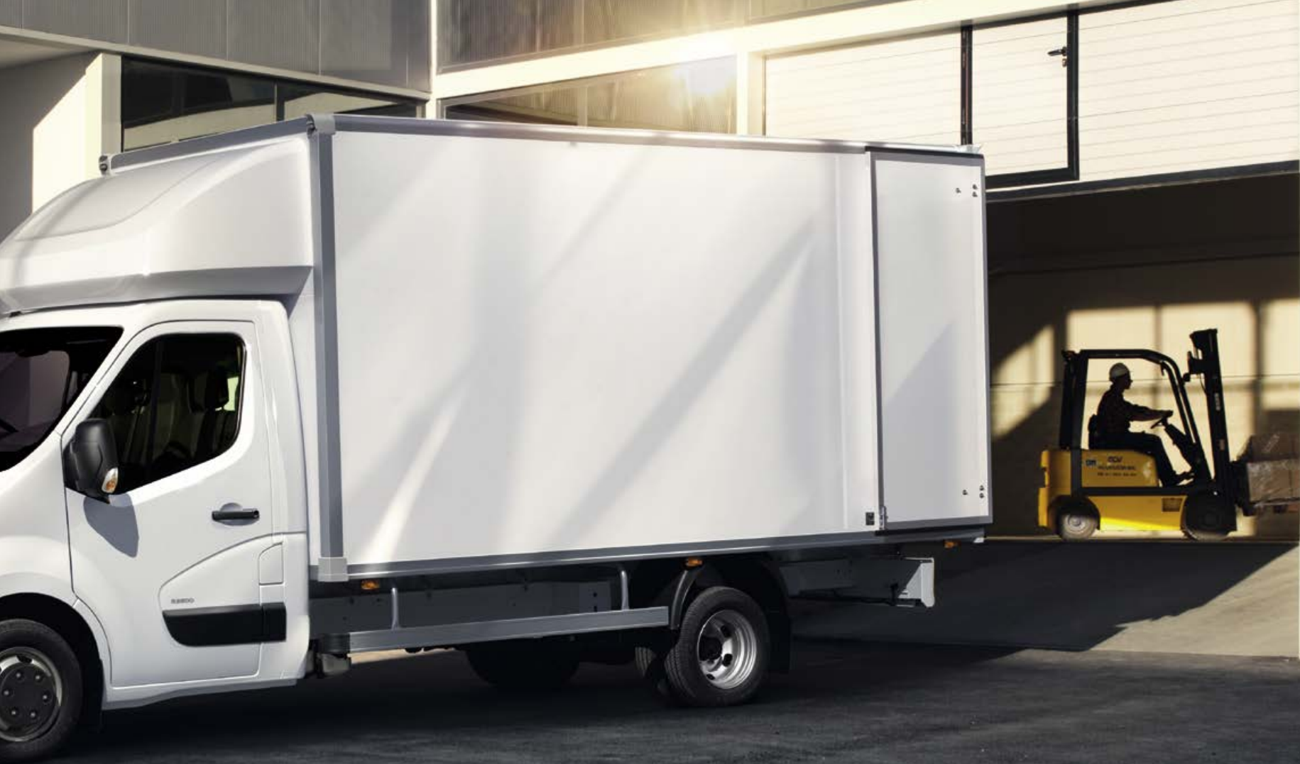
L4 H1 R3500 HD box van features Luton head, optional at extra cost.