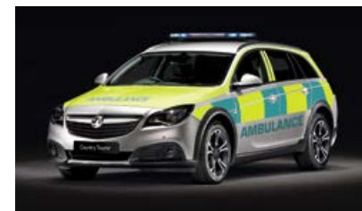
Insignia Country Tourer ambulance.