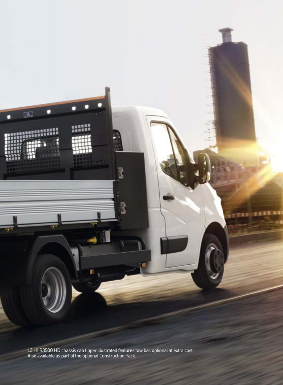
L3 H1 R3500 HD chassis cab tipper illustrated features tow bar, optional at extra cost. Also available as part of the optional Construction Pack.