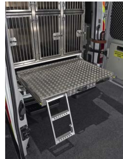
Movano police dog van.