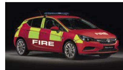
Astra fire support vehicle.