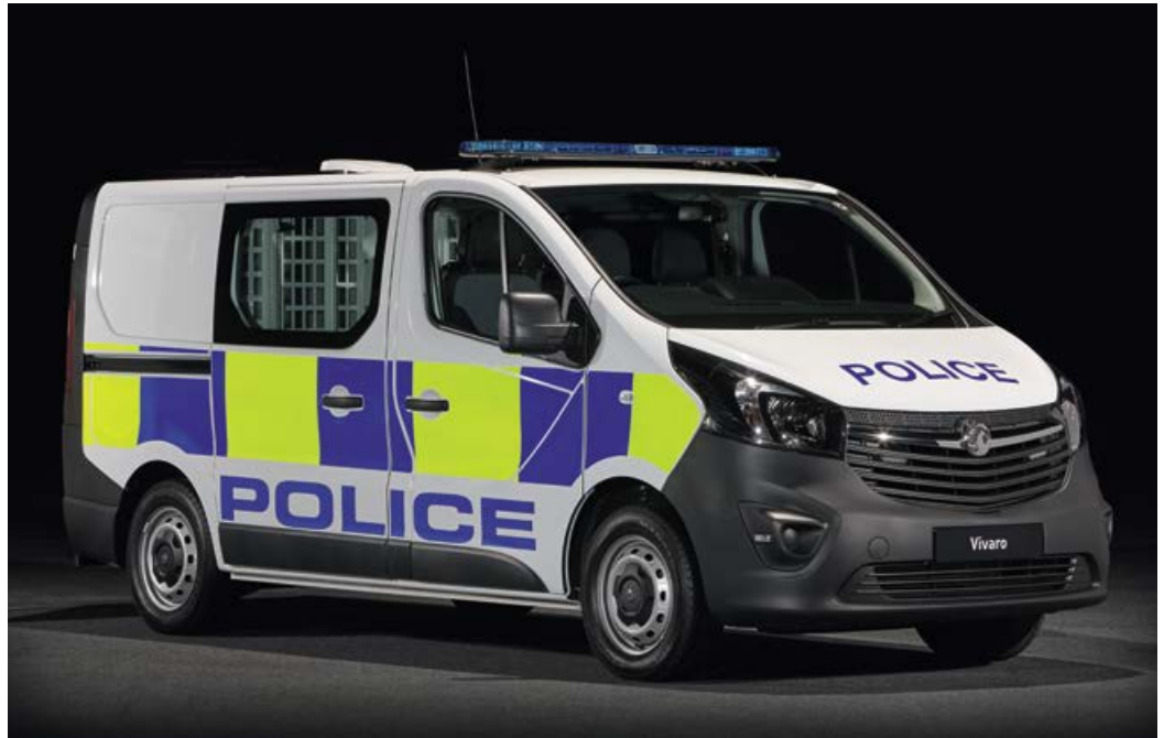
Vivaro police cell van.

Admin Team , Telephone: 01525 408320 Email: sales@vauxhallsv.co.uk