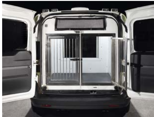
Combo police dog van.