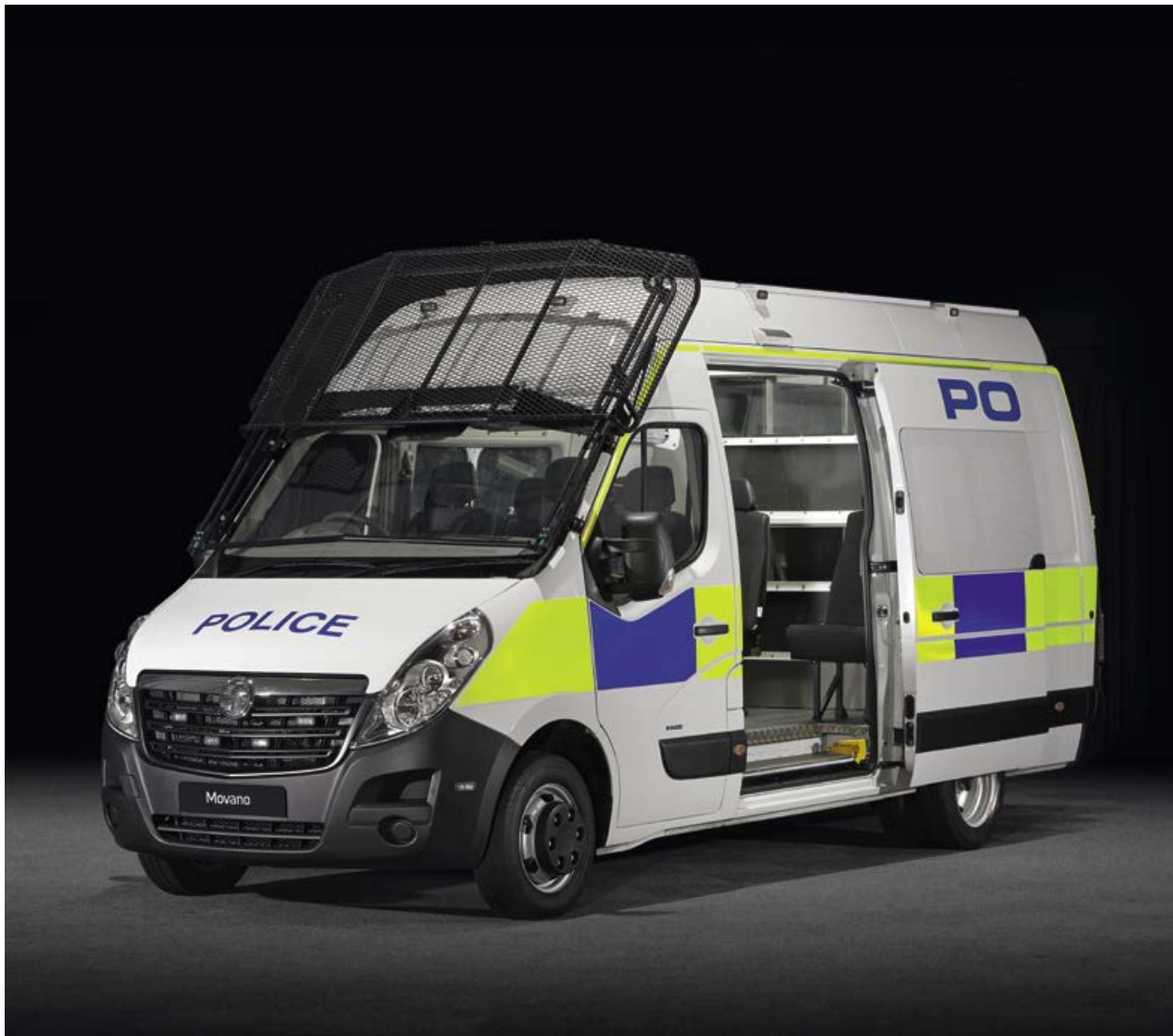
Movano police support unit.