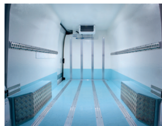
Optional pallet protection and load restraint rails.