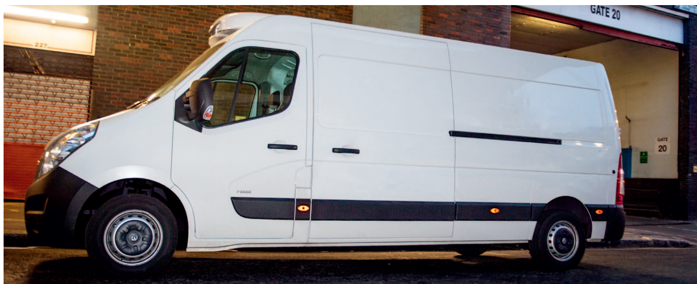
F3500, L3 H2 Movano temperature-controlled vehicle.

Perfect for the transportation of meat, fish and other temperature dependent chilled or frozen food deliveries, the Movano Cold Consortium refrigerated van conversion features lightweight load area insulation with an easy-clean, bactericide impregnated finish. Unlike many temperature-controlled vans, this Movano conversion is available with or without a PTO the latter installation saving costs and improving fuel economy. Other benefits include an eye-level, in-cab digital display for monitoring load area temperature which can be specified by the operator; chiller (0° to 8°C), low temperature (down to -18°C), deep freeze (down to -25°C) or multi-temperature.