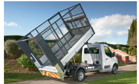
Five-stage ram provides a 50° tip angle.