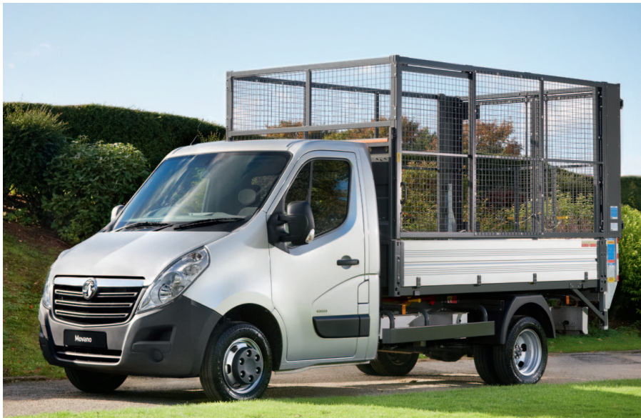
A 2.0m high cage with 50mm x 50mm galvanised mesh is fitted as standard.

The five-stage, chrome-plated under floor ram provides a 50° tip angle employing a high performance, 2kW electro-hydraulic power pack which can be operated via a cab-mounted, spiral wander-lead.