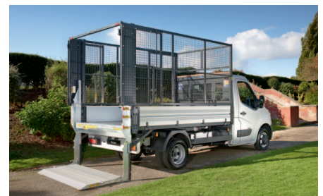
500kg tail lift is available as an option at extra cost.