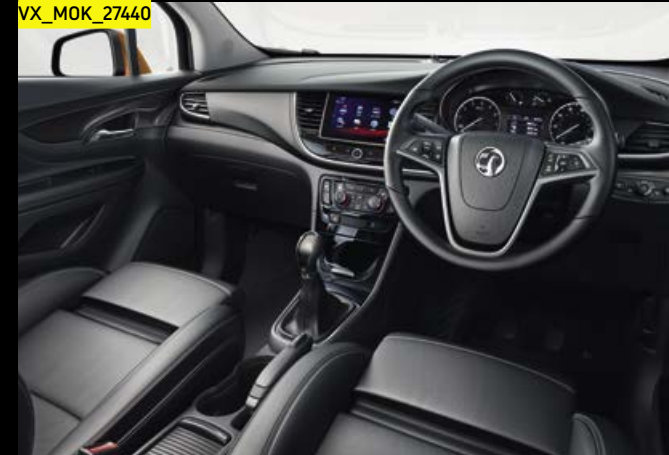
Elite Nav model illustrated.