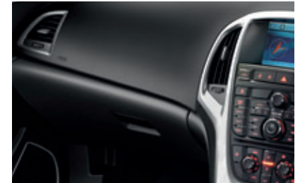
Leather – ergonomic sport seat** – Jet Black

Optional at extra cost on SRI models. Available with all exterior colours.