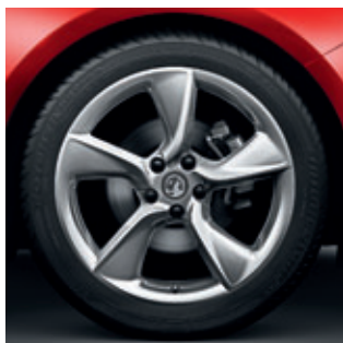
19-inch alloy wheel