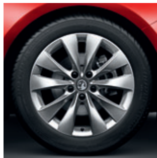
18-inch alloy wheel