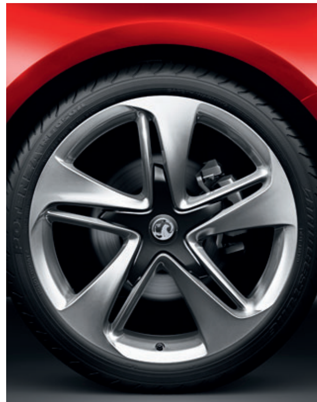
20-inch alloy wheel