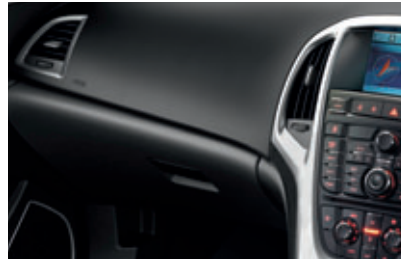
Imola/Morrocana Cloth – Jet Black

Standard on SRI models. Available with all exterior colours.