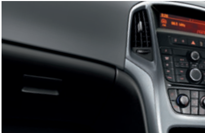
Silvanus Cloth – Dark Galvanised

Standard on Sport models. Available with all exterior colours.