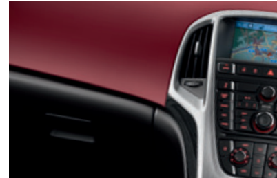
Imola/Morrocana Cloth – Morrello Red

No cost option on SRI models. Available with all exterior colours except Flaming Yellow and Silky Shadow.