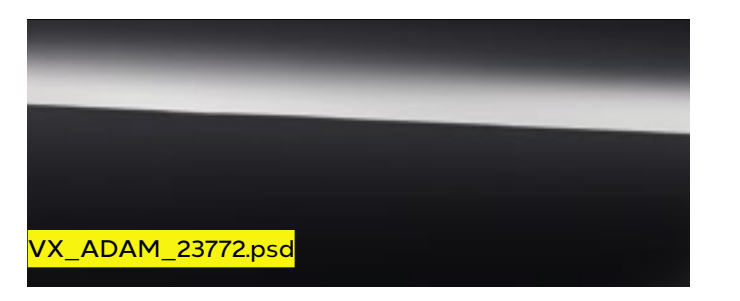
Black Jack Metallic