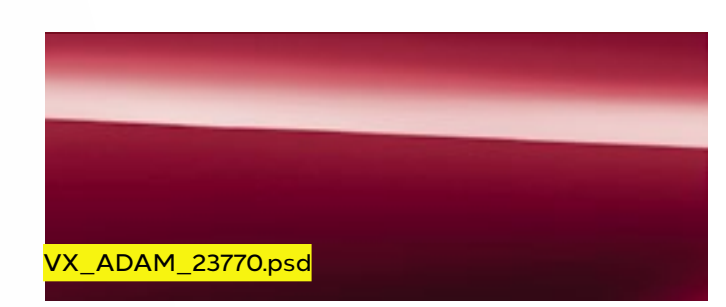
Red 'n' Roll Brilliant