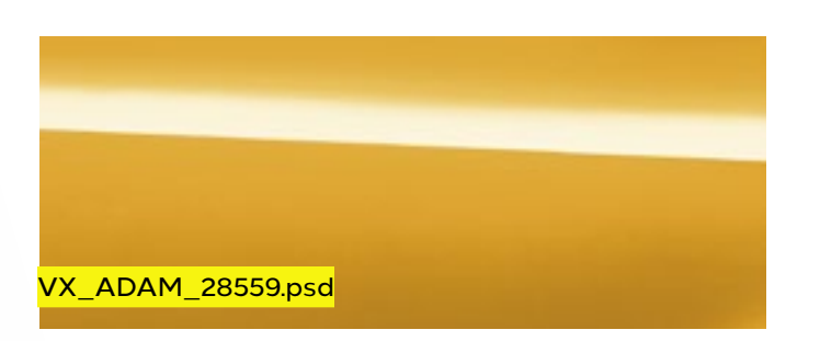
Orange Alert Solid

All you need to do now is choose a colour that's totally you at no additional cost.