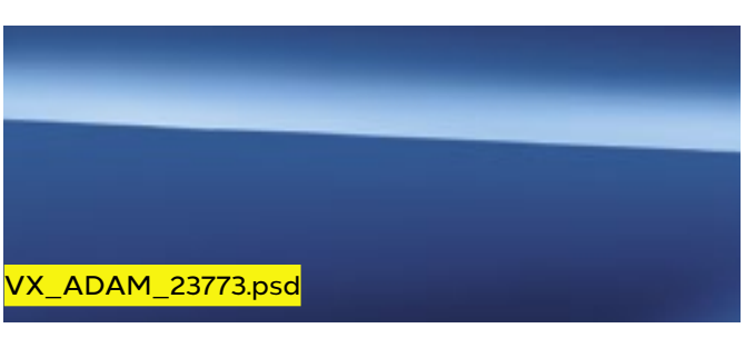
Let it Blue Premium