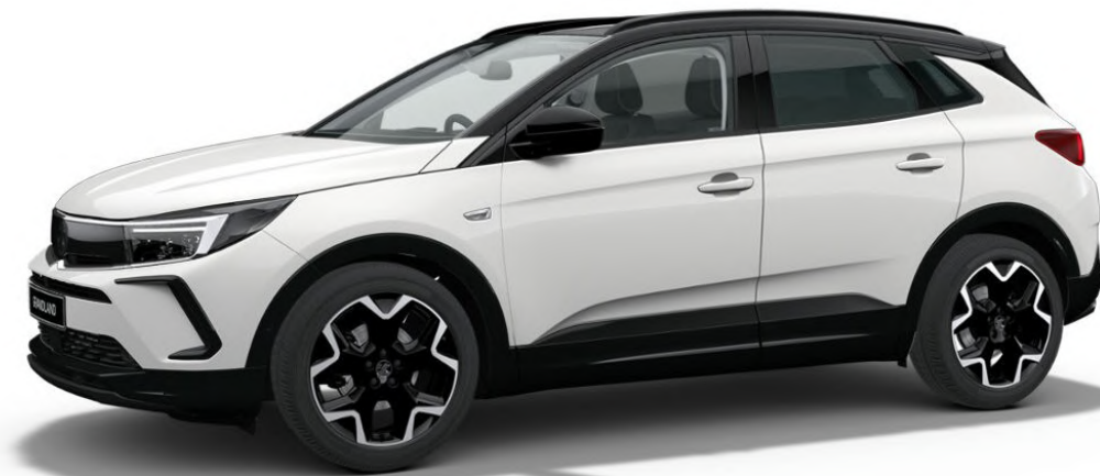
Grandland Ultimate JO.tiff