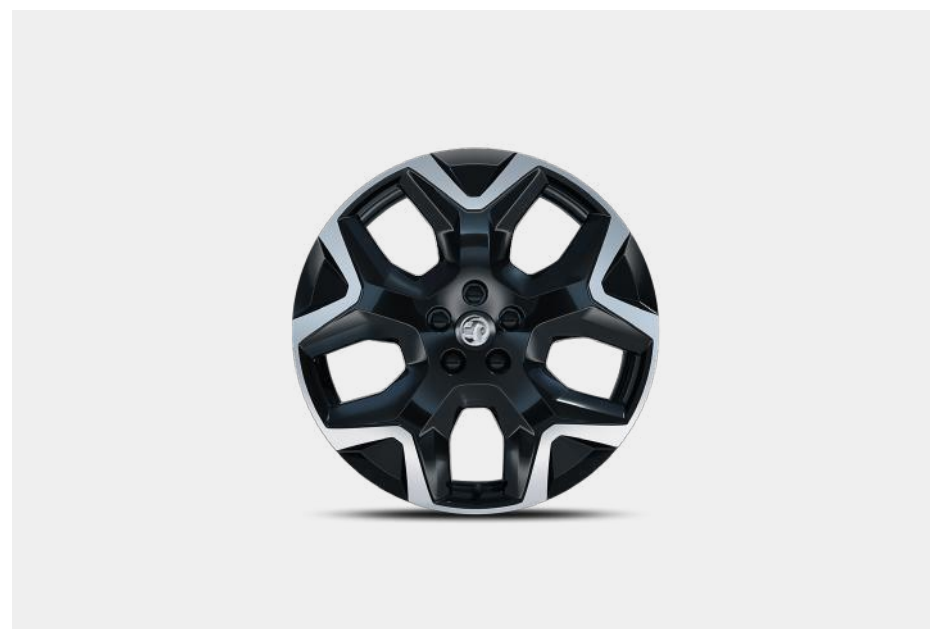
19-inch alloy wheel.