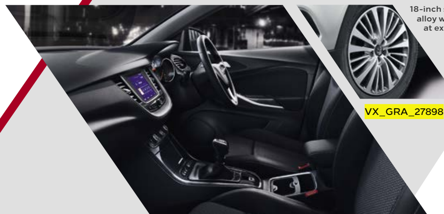
18-inch silver-effect alloy wheels optional at extra cost.