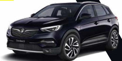
Amethyst Purple – Two-coat Premium