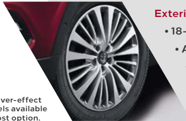
18-inch silver-effect alloy wheels available as a no-cost option.