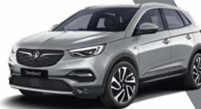
Quartz Grey – Two-coat Metallic