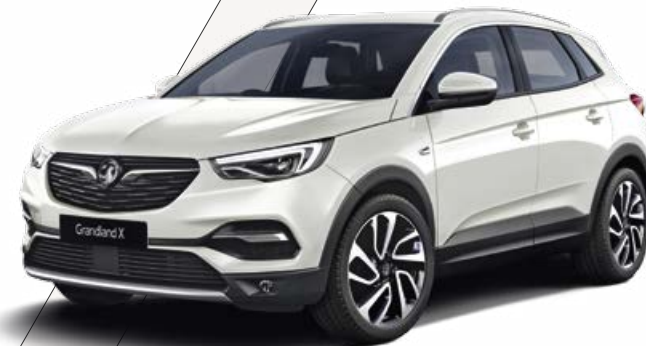
Pearl White – Tri-coat Premium

The vehicles shown are for colour illustrative purposes only and do not represent a specific model. *Please refer to the latest Grandland X Price and Specification Guide available from vauxhall.co.uk for details of colour availability by model and price. Due to the limitations of the printing process, the colours reproduced may vary slightly from the actual paint colour and trim material. As a result, they should be used as a guide only. Your Vauxhall retailer has a comprehensive display of paint finishes.