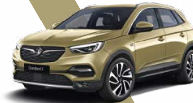
Golden Sunstone – Two-coat Premium