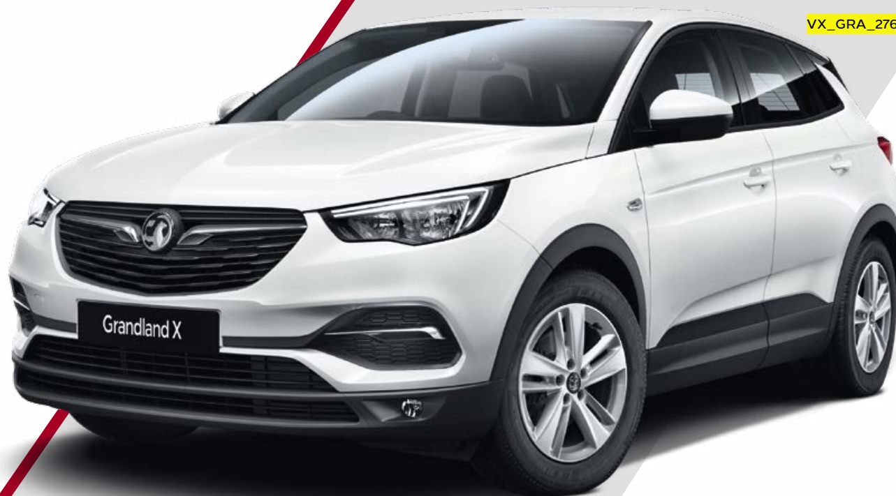
White Jade brilliant paint is optional at extra cost.