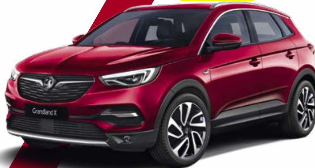
Dark Ruby Red – Two-coat Metallic