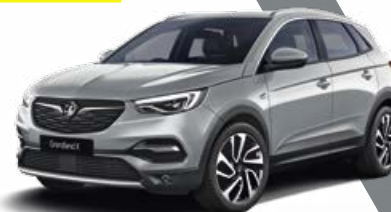
Quartz Grey – Two-coat Metallic