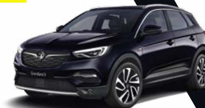
Amethyst Purple – Two-coat Premium