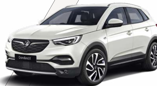
Pearl White – Tri-coat Premium

The vehicles shown are for colour illustrative purposes only and do not represent a specific model. *Please refer to the latest Grandland X Price and Specification Guide available from vauxhall.co.uk for details of colour availability by model and price. Due to the limitations of the printing process, the colours reproduced may vary slightly from the actual paint colour and trim material. As a result, they should be used as a guide only. Your Vauxhall retailer has a comprehensive display of paint finishes.