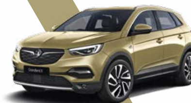
Golden Sunstone – Two-coat Premium